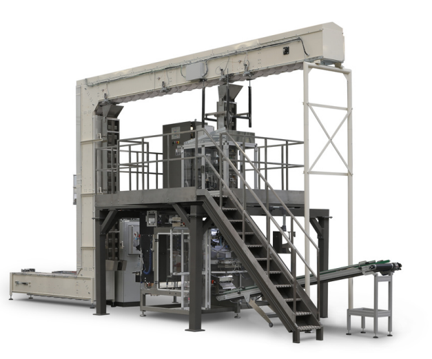
In the picture G12VS150, packaging system able to make 30 bags per minute of 10 pounds or 50 bags per minute of 5 pounds

Ricciarelli has also presented the packaging units for 5 and 10 pound bags , solutions for long and short pasta, capable of producing up to thirty 10-pound bags per minute and fifty 5-pound bags per minute, and the classic automatic horizontal packaging machines for long pasta in bags made from a reel of plastic film.